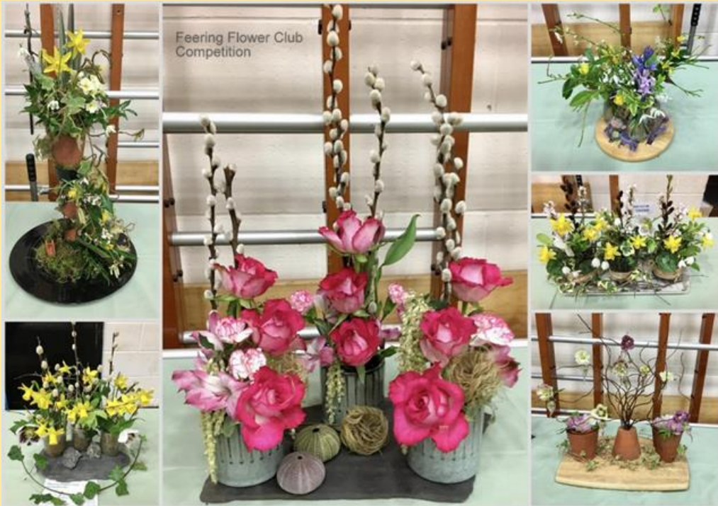
Members competition "Three Little Pots "; members vote for their favourite at the AGM and prizes/cups are awarded