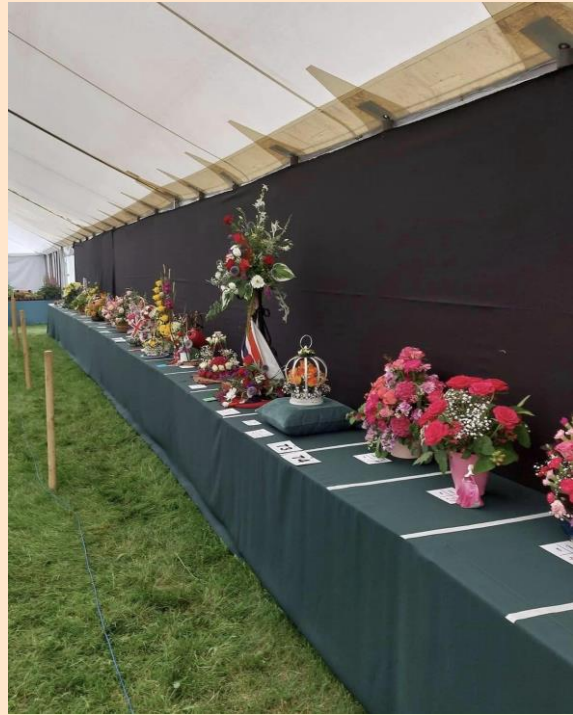
The Sandringham Show 2023