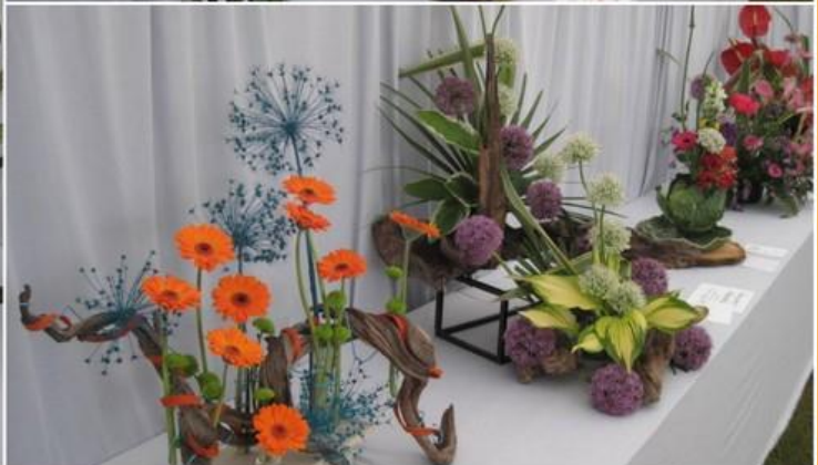
Words & Pictures – Lindi Carrington