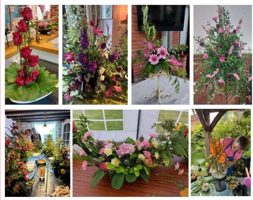
Dereham members' summer workshop designs

Many clubs organise an outing rather than a club meeting in August