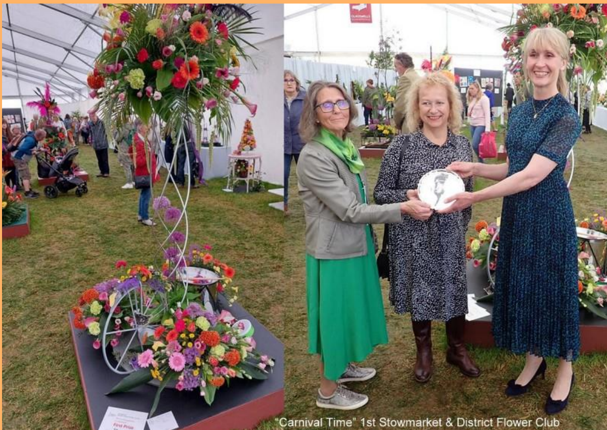
“Carnival Time” 1st Stowmarket & District Flower Club