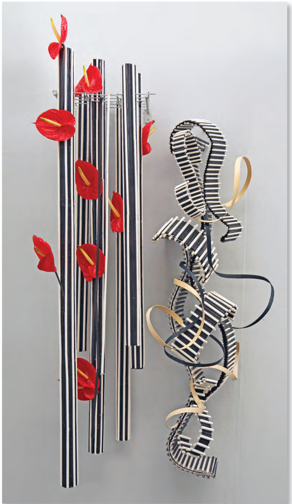
Arranger: Eileen Barraclough

Strong contrasts provide immediate visual impact in modern designs and unbroken areas of colour are a strong design feature in contemporary designs. Pure colour is often used in abstract designs to create movement or drama with dyed or painted plant material enhancing a design if used with discernment.