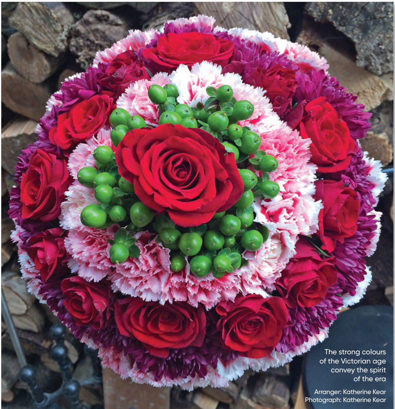
The strong colours of the Victorian age convey the spirit of the era

Colour can be used to convey the spirit of the age in period arrangements – the polychromatic jewel colours of the 16th Century Tudor times, the pastel tints of the Rococo period or the dark tones of the Victorian age.