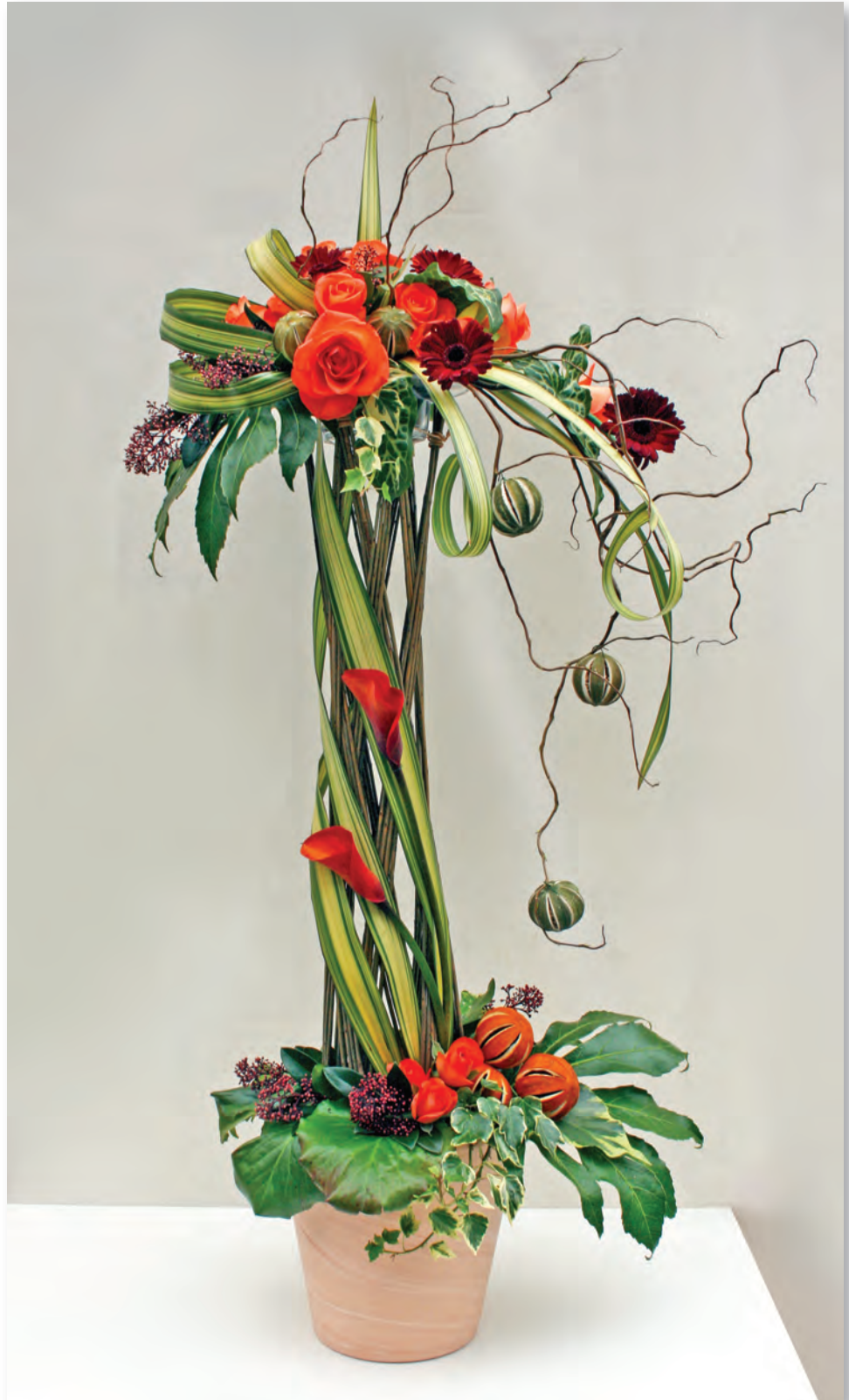
Arranger: Valerie Guest

Lighter tints appear larger in size and lighter in weight. Darker shades appear smaller in size and heavier in weight and dark tones give depth to a design. Colours appear most normal against a grey background. Colour can contribute to the development of rhythm with repetition encouraging the eye to travel through the design.